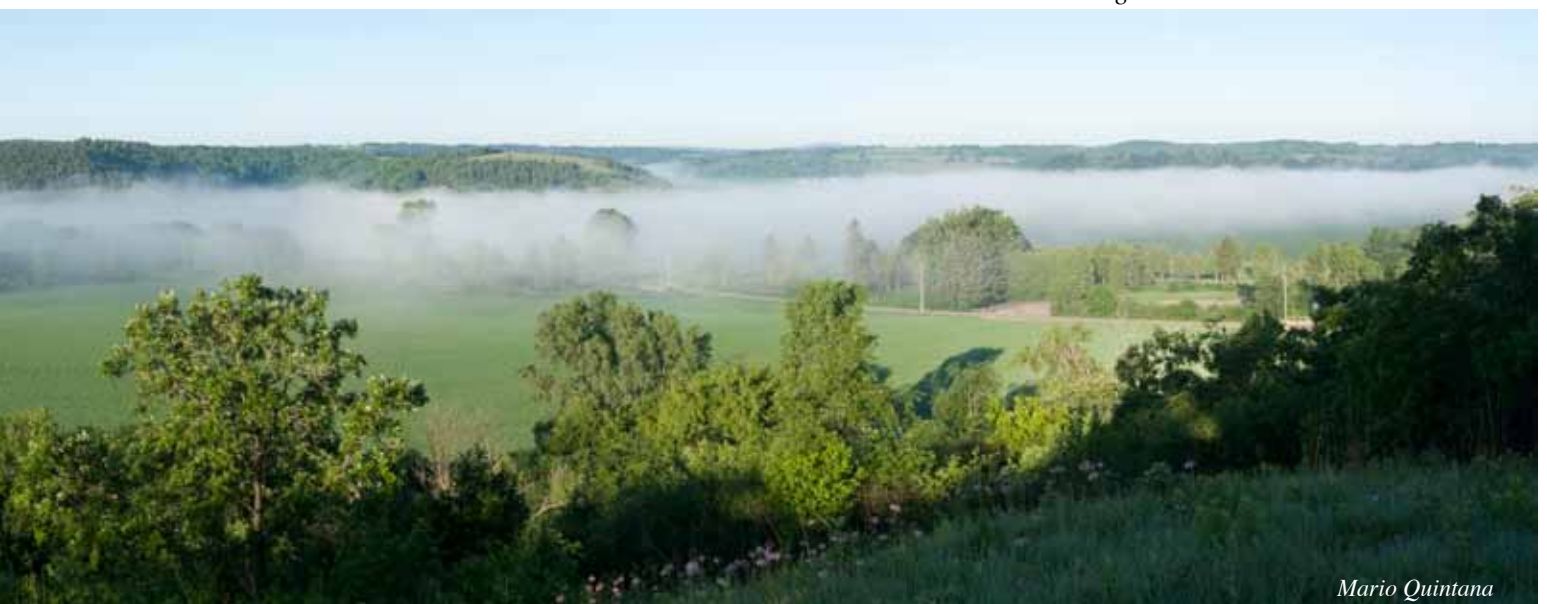
View from Festge Park south toward Black Earth Creek

volunteers, the Sierra Club, REI, and others are doing the work. Brush and trees will be burned and new pond plants and shore plantings will help to restore the area to a more useful and appealing condition. The pond has become much more visible from Sherbel Road and Hwy 14.